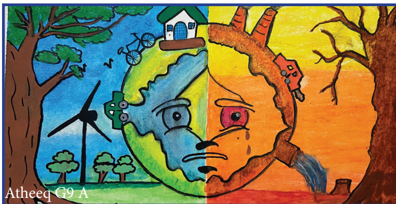
Atheeq G9 A