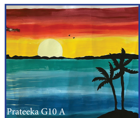
Prateeka G10 A