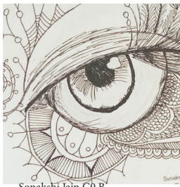
Sonakshi Jain G9 B