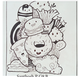
Santhosh P G9 B