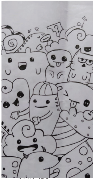
Rakshitha G7 B