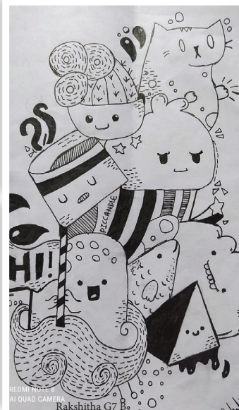
Rakshitha G7 B